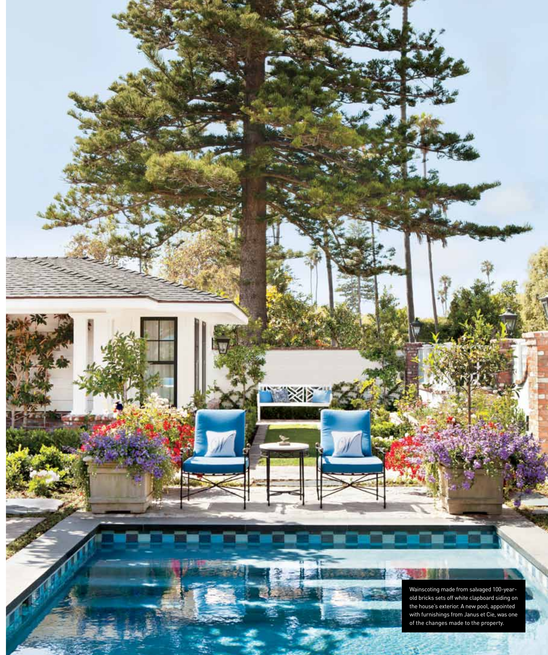
Wainscoting made from salvaged 100-year-old bricks sets off white clapboard siding on the house's exterior. A new pool, appointed with furnishings from Janus et Cie, was one of the changes made to the property.