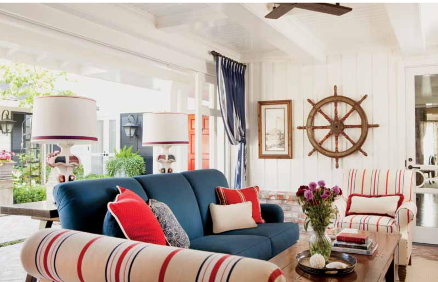
Above: In the loggia, a stripe from Ralph Lauren Home covers two armchairs, and a sofa is upholstered with fabric from Pindler & Pindler. A mounted wheel from West World Imports lends character. Right: A planter from the Warren Sheets Accessories Collection pairs with a playful dog figurine on the living room mantel.