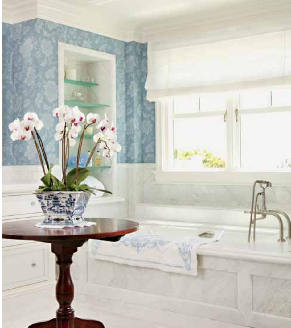
In the master bathroom, Sheets chose a Ralph Lauren Home fabric for the window shade and centered the client's own table in the airy room. Blue floral wallpaper by Thibaut brings a colorful touch to the space. The tub filler is from Sigma.